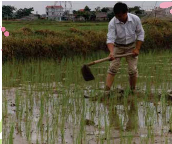
Cao Loi school's Principal was the most dedicated teacher we're ever met