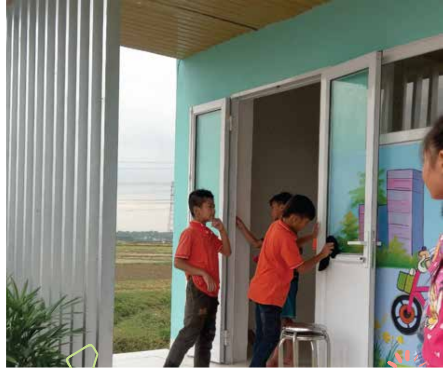
The new school was cleaned and decorated by students