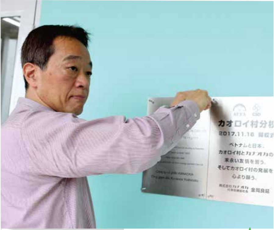
The opening ceremony of new school with our donors!