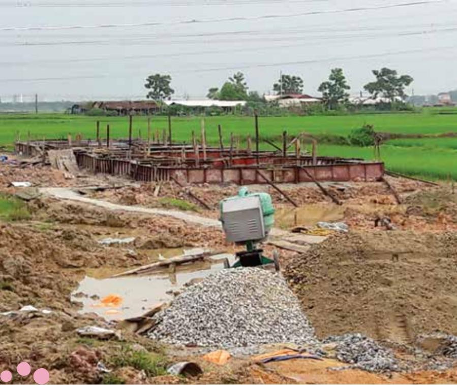
The new school will be on this place!